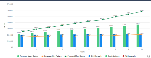
Fig. 1 Outcome Projection Forecast by Year of the Investment Term